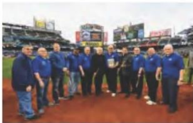
NYS Knights of Columbus receiving the Mets Spirit Award in 2019

following the 2023 Induction of the New York Mets Hall of Fame