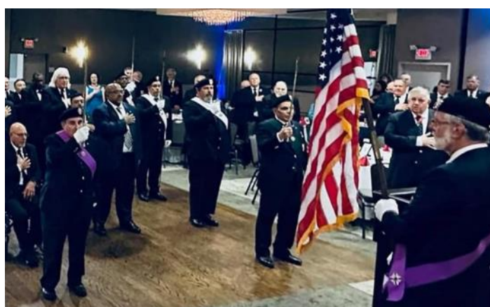
Colors presented at banquet following the Fourth Degree Exemplification which was held at the Crown Plaza in Suffern NY, on Saturday May 6, 2023. (Photo posted by Master Bill Venturini on Facebook)