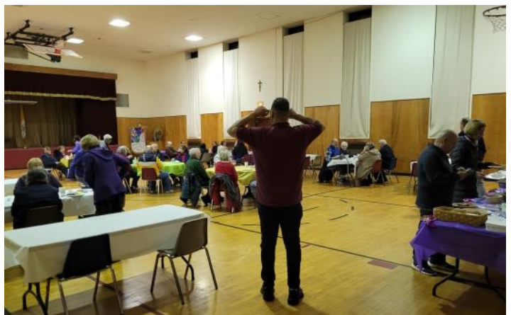
A good turnout at the Pancake Dinner, cooked by Wappingers Council Knights, and served by the Catholic Daughters of the Americas, Court Queen of Peace, on Shrove Tuesday 2023.